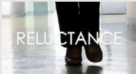
Winning entry of IB short film on Academic Honesty To view click here