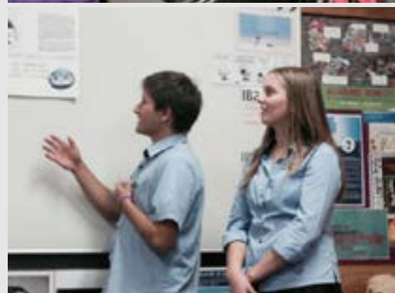
Knowledge questions are presented in Theory of Knowledge on missing flight MH370