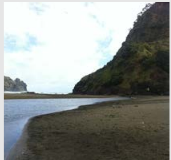
Year 2 Geography field trip to Piha