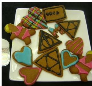
TMF Festive Occasion