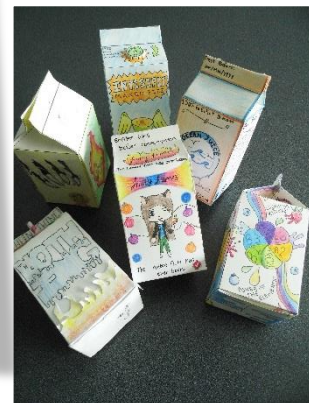
DVC Super Hero Juice