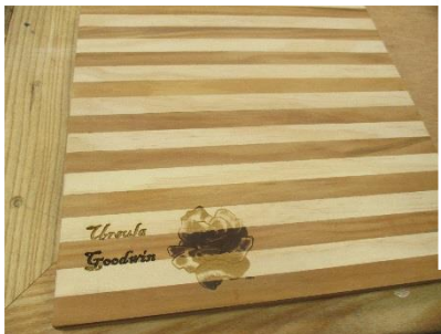
TMR Sustainable Gift