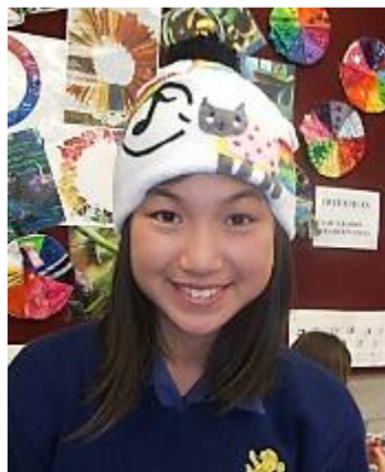
TMS Game On